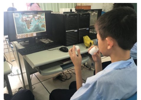
(a) Student playing Fragrance Channel under the PCWithOlfaction condition

Fig. 2 Students playing Fragrance Channel