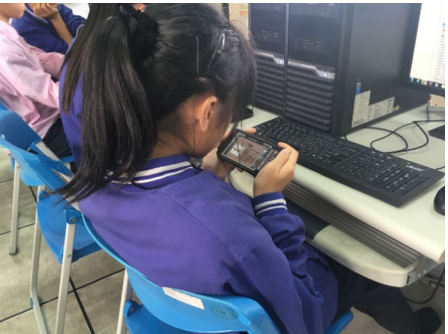
(b) Student playing Fragrance Channel under the Mobile Without Olfaction condition

Fig. 2 Students playing Fragrance Channel