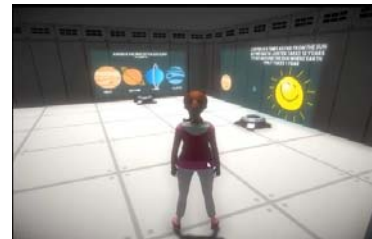
Final Frontier game – Virtual Library