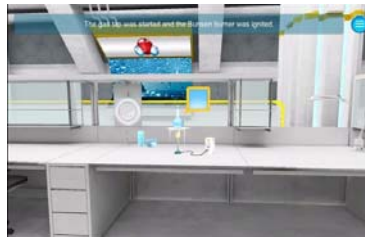
Water Cycle in Nature application (Virtual Lab - Boiling Experiment)