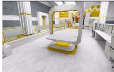
Sea-life application – Virtual Lab