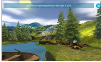
Water Cycle in Nature application (Nature Environment)